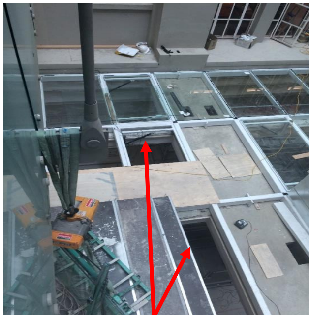
Open unprotected fall hazards

REPORT UNSAFE WORK PRACTICES - CALL (08) 9228 6900 OR EMAIL SAFETY@CFMEUWA.COM